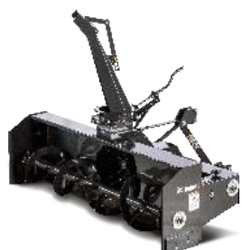
3 pt. snowblower