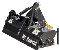
3 pt. tiller