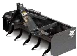
3 pt. box blade