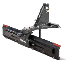
3 pt. angle blade