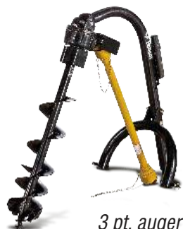
3 pt. auger

There are more than 550 dealer locations in North America, so you're never far from an expert source of implements, attachments, accessories, parts and service.