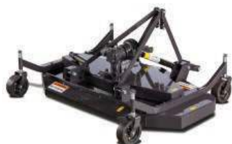
3 pt. finish mower