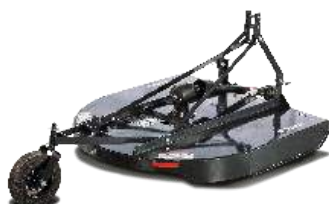
3 pt. rotary cutter