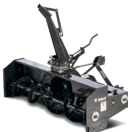
3 pt. snowblower