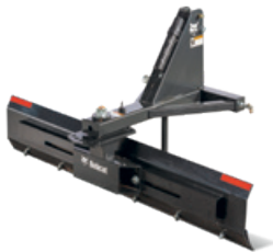
3 pt. angle blade