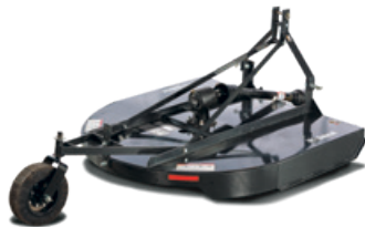
3 pt. rotary cutter