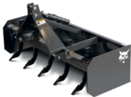
3 pt. box blade