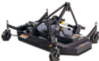
3 pt. finish mower