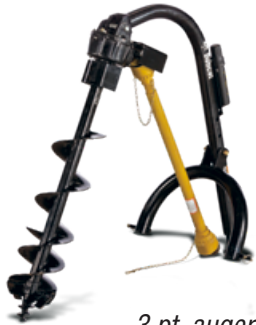
3 pt. auger